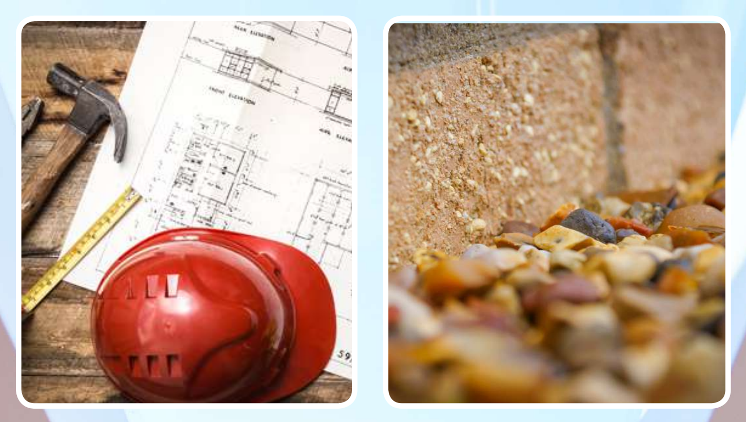
We can design and install garages, garage conversions, patios, extensions, porches, kitchens, bathrooms, garden walls, tile roofing, car ports, driveways, conservatories and orangeries.

Taverham Construction will take care of your home extensions, garage conversions and building design alterations. Our fully qualified tradesmen will look after building design projects and manage the entire thing so you don't have to worry. We'll take the stress out of it for you by managing every step of the way from initial drawings through to completion. Contact us to discuss your needs.