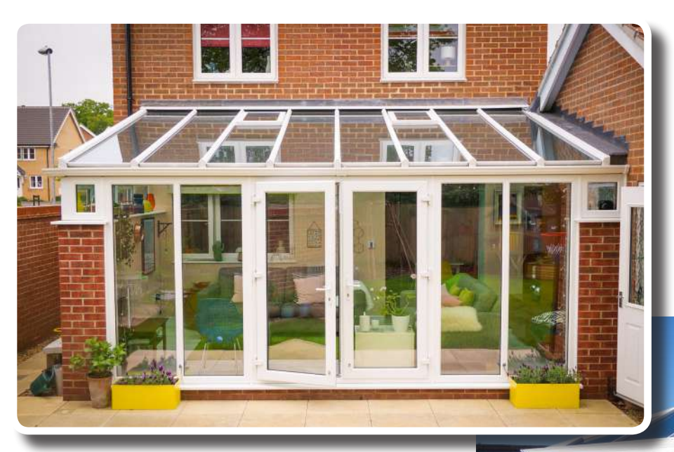
"Had these build me a conservatory. It's way and above what I expected, the quality is superb...." Mr Massingham - 01/10/2014

For properties with little room under the eaves or for those homeowners that prefer a clean simple look, a lean-to conservatory is the idea choice. The pitch of the roof can be varies, making this a versatile and ever-popular style option.